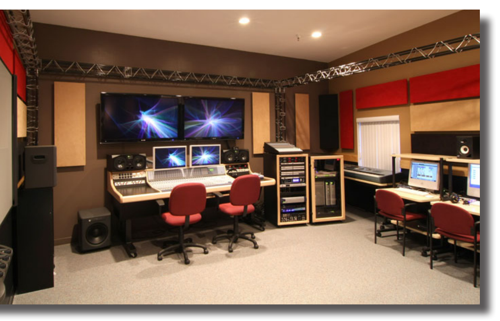
UCI Arts' sound studio will benefit from a gift from Meyer Sound Laboratories.

I am pleased to report that our sound design program has received a generous $300,000 gift from Meyer Sound Laboratories, a premier audio company with customers and offices worldwide.