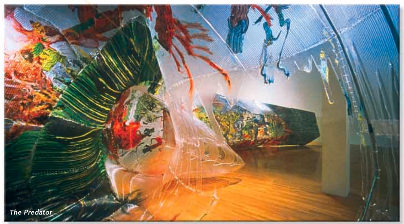
The Predator