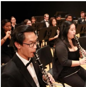
UCI Wind Ensemble