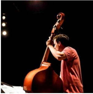
Jazz Concert: The UCI Small Groups