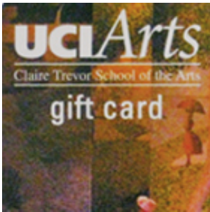
Give the gift of the Arts!

Box Office / Ticket Sales Information (949) 824-2787 | artstix@uci.edu