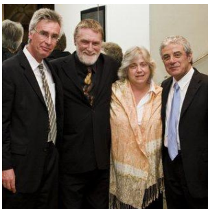
London Music Club Quartet