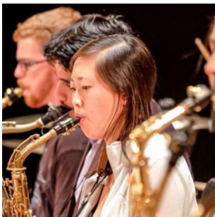
UCI Jazz Orchestra Fall Concert