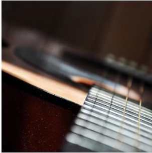
UCI Guitar Studies Concert