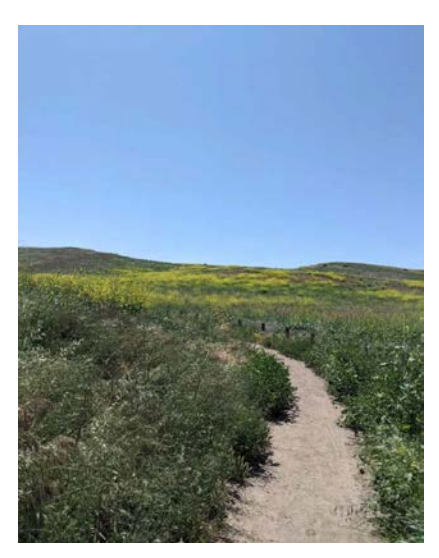
Embodied Nature Writing Workshop and Research Project