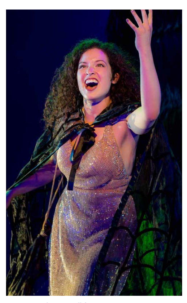
A production still from INTO THE WOODS