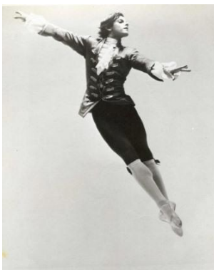
Monthly Guest Artist Series