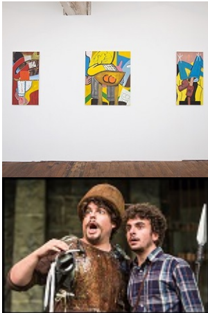
Man of La Mancha