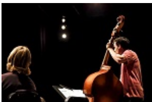
Music Showcase Concert