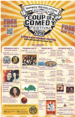
The Coup de Comedy Festival 2016