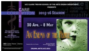
An Enemy of the People