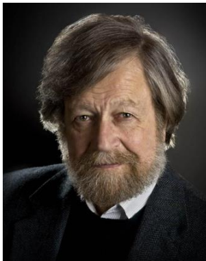
Choral Music at UCI