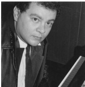
Faculty Artist Series