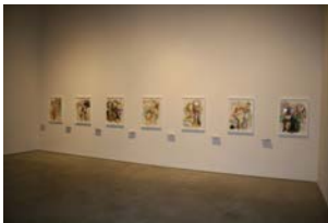
MFA Thesis Exhibition, Part II