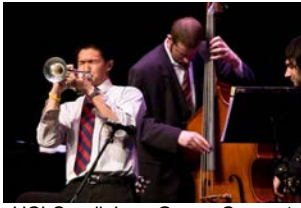
UCI Small Jazz Group Concert