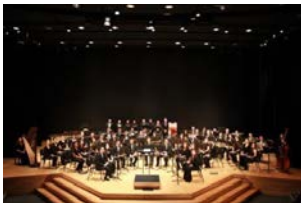
UCI Wind Ensemble