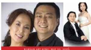
Korean Art Song

ILLUMINATIONS: Mozart and the Fortepiano