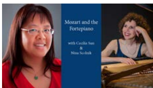
Mozart and the Fortepiano