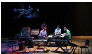
ICIT Showcase Concert