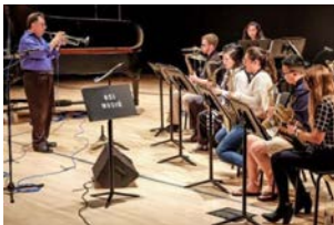
UCI Jazz Orchestra Concert