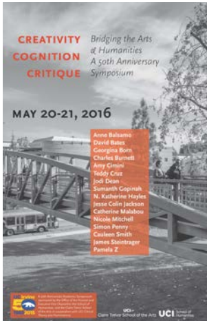
Creativity, Cognition, Critique