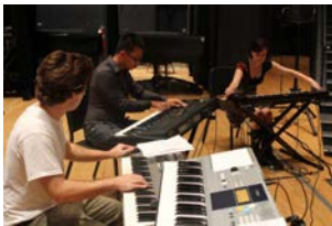
Center for Interesting Noises