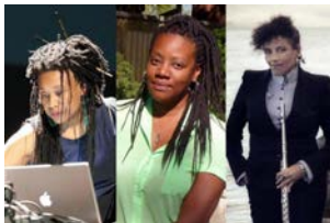
Random Access Music Universe