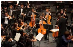
UCI Symphony Orchestra