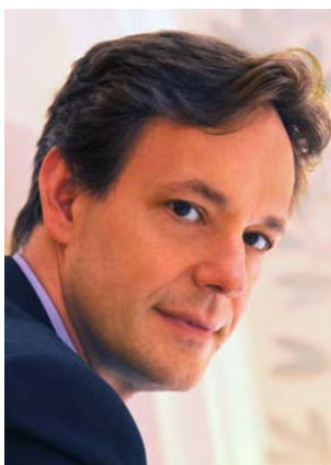
Songs of Jake Heggie