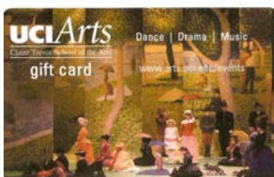
Give the gift of the Arts!