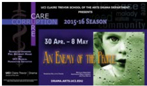
An Enemy of the People