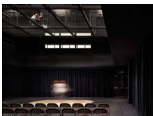
THE TELEMATIC PROJECT