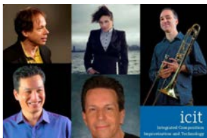
Faculty Artist Series

viola J. Brahms' Piano Quartet in g minor, op. 25.