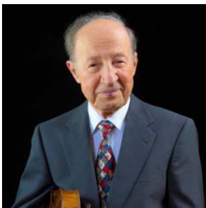
Faculty Artist Series