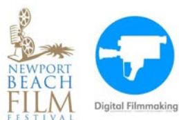
Digital Filmmaking Showcase