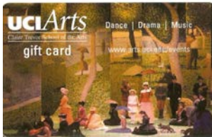
Give the gift of the Arts!