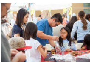
Beall Family Day