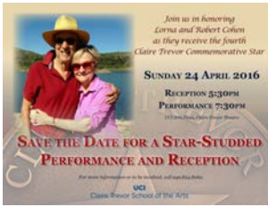
Claire Trevor Commemorative Star Event