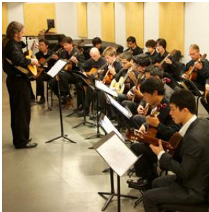
UCI Guitar Ensemble Concert