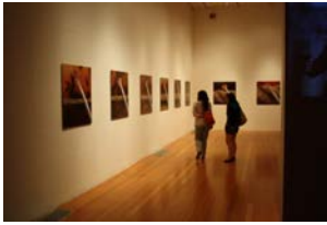
MFA Thesis Exhibition