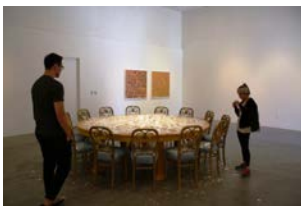
Providence, Sovereignty, Volition

Providence, Sovereignty, Volition Undergraduate Solo Project